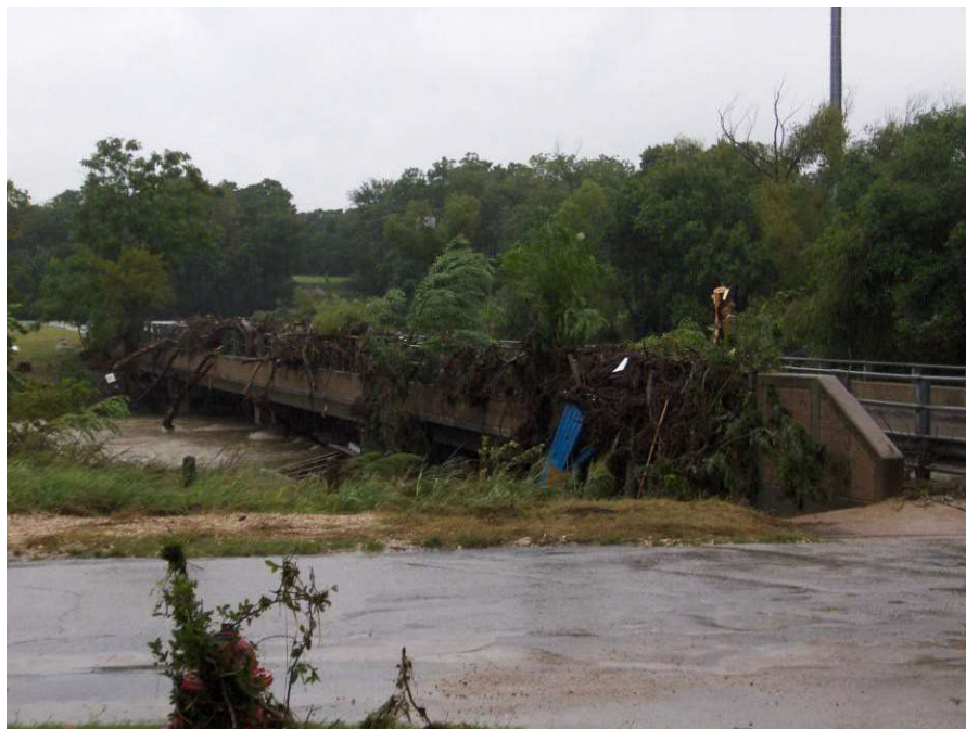
Great Oaks Drive bridge on September 8, 2010

Additionally, during heavy rain events, the existing Great Oaks Drive bridge over Brushy Creek obstructs the flow of water due to the level of the existing bridge structure; this then contributes to upstream flooding. The Great Oaks Drive bridge has previously flooded on September 8, 2010. During this flood, the water crested over the bridge railing by several feet, causing access issues for emergency services and creating an unsafe roadway for drivers.