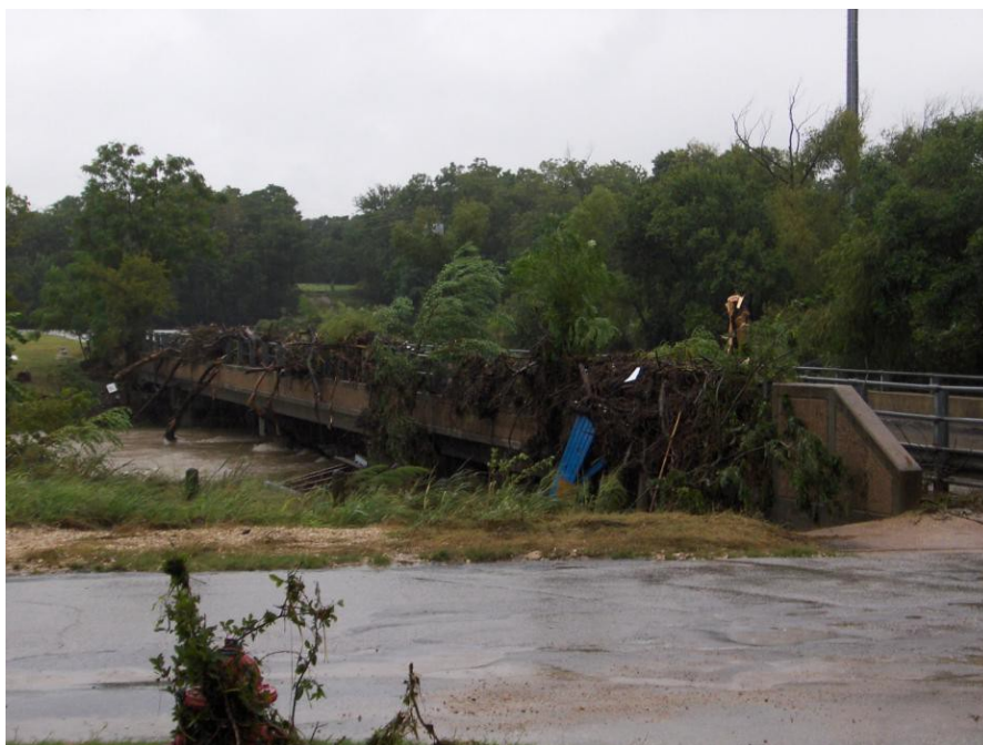
Great Oaks Drive bridge on September 8, 2010

Additionally, during heavy rain events, the existing Great Oaks Drive bridge over Brushy Creek obstructs the flow of water due to the level of the existing bridge structure; this then contributes to upstream flooding. The Great Oaks Drive bridge has previously flooded on September 8, 2010. During this flood, the water crested over the bridge railing by several feet, causing access issues for emergency services and creating an unsafe roadway for drivers.