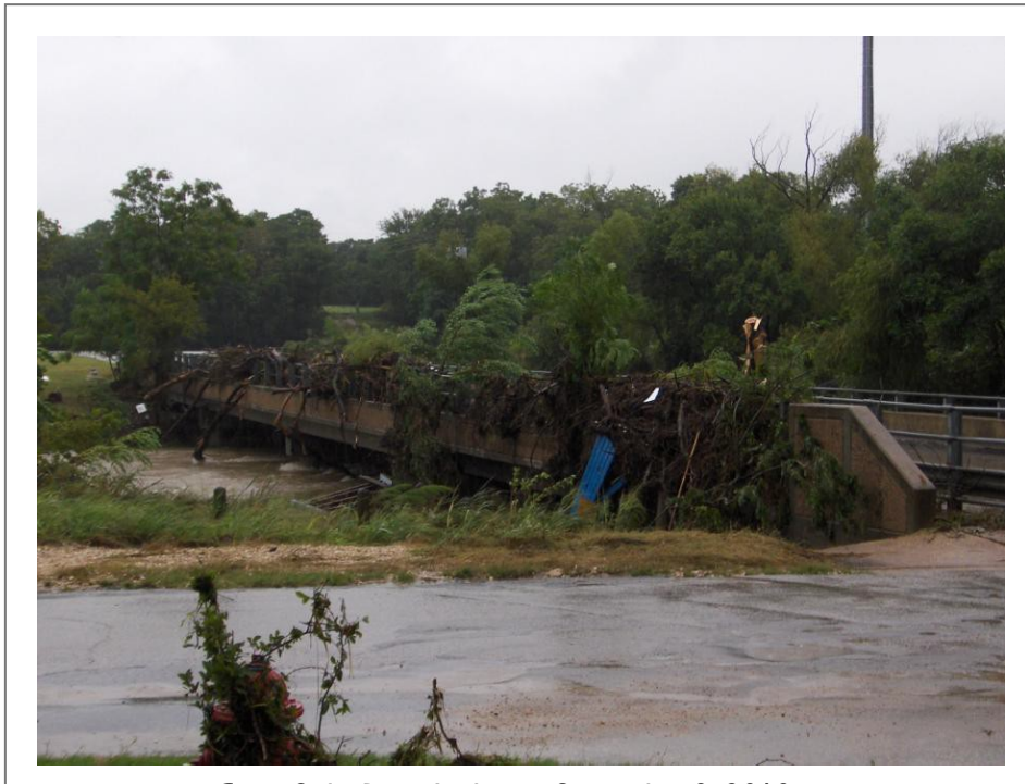
Great Oaks Drive bridge on September 8, 2010

Additionally, during heavy rain events, the existing Great Oaks Drive bridge over Brushy Creek obstructs the flow of water due to the level of the existing bridge structure; this then contributes to upstream flooding. The Great Oaks Drive bridge has previously flooded on September 8, 2010. During this flood, the water crested over the bridge railing by several feet, causing access issues for emergency services and creating an unsafe roadway for drivers.